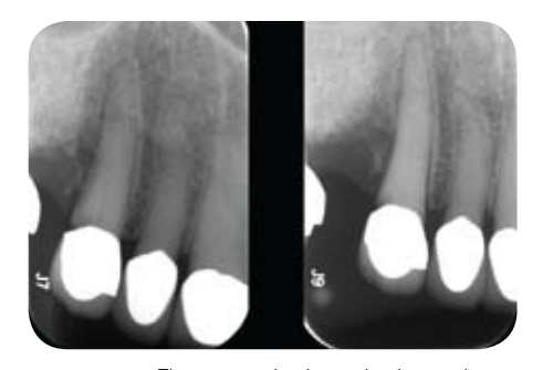
FIGURE 1C. The periapical radiographs show with more detail the involved areas around tooth No. 6.

bilateral mastectomies, several cycles of chemotherapy, and radiation. She later developed several areas of skeletal metastasis and severe pain. Recently, she had her left leg irradiated due to intense pain and a fracture due to extensive metastasis. Two months prior to her visit to NSU, the patient experienced intense pain. At that time, she was submitted to surgery for a complete hip replacement. The patient was receiving only hormonal therapy and no other cancer treatment modality.