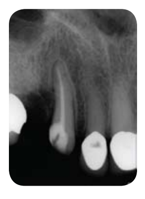
FIGURE 2. Final radiograph after endodontic therapy. Observe sclerosis at the lamina around tooth No. 6. This may be an early sign of BON.