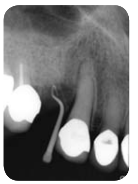
FIGURE 1D. Localization of the osseous defect with a gutta-percha point ending directly at the extraction site of tooth No. 5.

6. The anterior right maxilla was painful upon palpation and teeth Nos. 6 and 7 were sensitive to percussion and palpation. Purulence could be expressed from the sulcus around No. 6; however, no visible necrotic bone could be found during the clinical examination (FIGURE 1A). Panoramic and periapical radiographs revealed radiolucency and evidence of bone loss around the root of tooth No. 6 as well as a vertical defect with an irregular contour on the distal surface at the alveolar crest. A localization radiograph showed a gutta-percha point that was introduced through the sulcus, distal of No. 6 and localized at the extraction site of tooth No. 6 (FIGURES 1B-C). Vitality pulp testing confirmed a necrotic pulp for No. 6 and positive for No. 7 and the contralateral teeth.